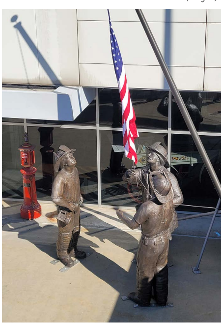
This bronze statue stands tall and proud at "The Rock" symbolizing the raising of the flag at Ground Zero.