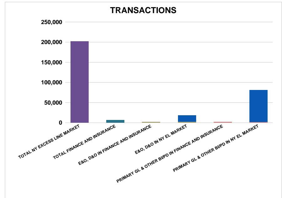
Top Coverage Categories in the Finance And Insurance Industry by Transactions

E&O, D&O Finance And Insurance Premium of $67,158,080 represents 19.35% of all Finance And Insurance Risk Premium and 19.38% of all YTD JUNE 2023 E&O, D&O Premium.